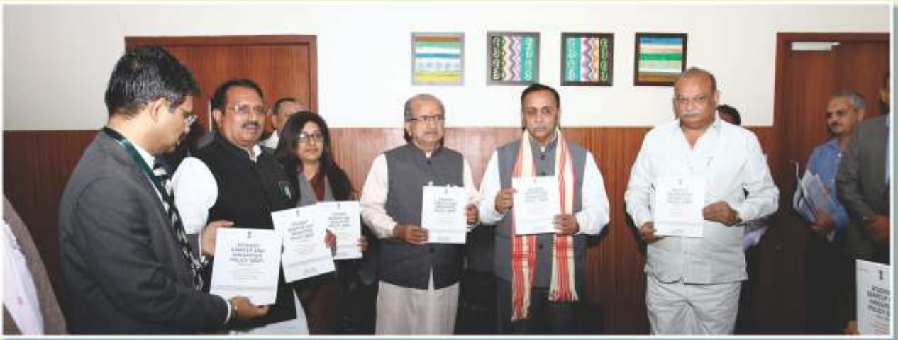
SSIP Policy Launch on 8 th January, 2017.