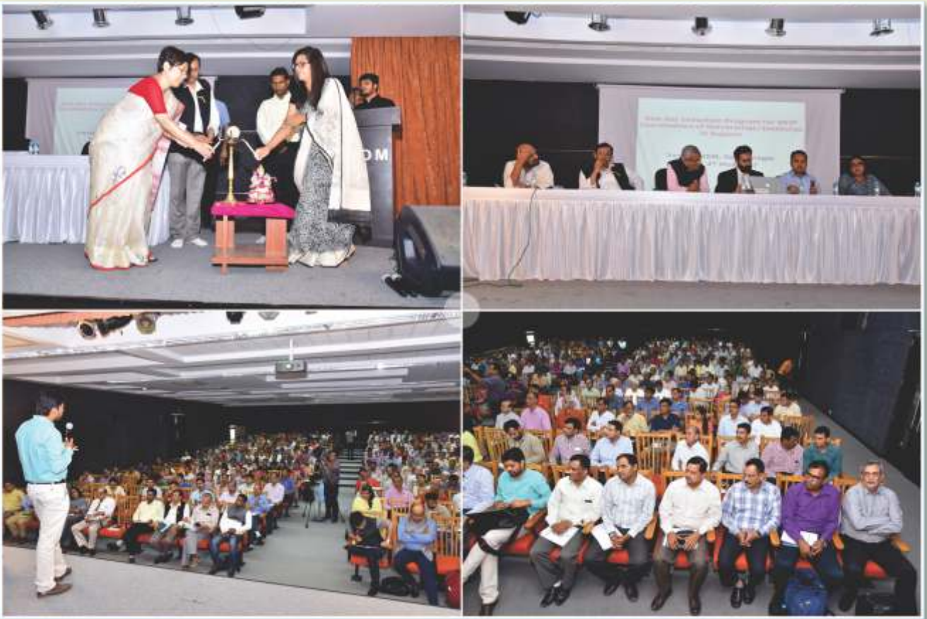
Induction Program for SSIP Coordinators at GIDM on 4 th May, 2017.