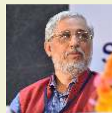
Prof. Anil Sahasrabudhe, Chairman, AICTE.

"SSIP will further add momentum to national student start-up efforts of AICTE. This timely intervention of Gujarat education department will be a huge gain for 100s of young student innovators and start-ups. AICTE will extend all possible support to SSIP efforts at grassroots level in Gujarat. This policy will inspire many more states to initiate similar interventions. This will contribute significantly to "Start-up India Stand-up India" movement"