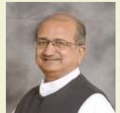
Shri Bhupendershign Chudasma Hon. Education Minister, Gujarat.

“SSIP Gujarat will fulfil the much standing need of supporting student innovators at early stage and motivate them to start-up early. In long run the implication of this policy will strongly help every university to develop sustainable innovation & start-up ecosystem”