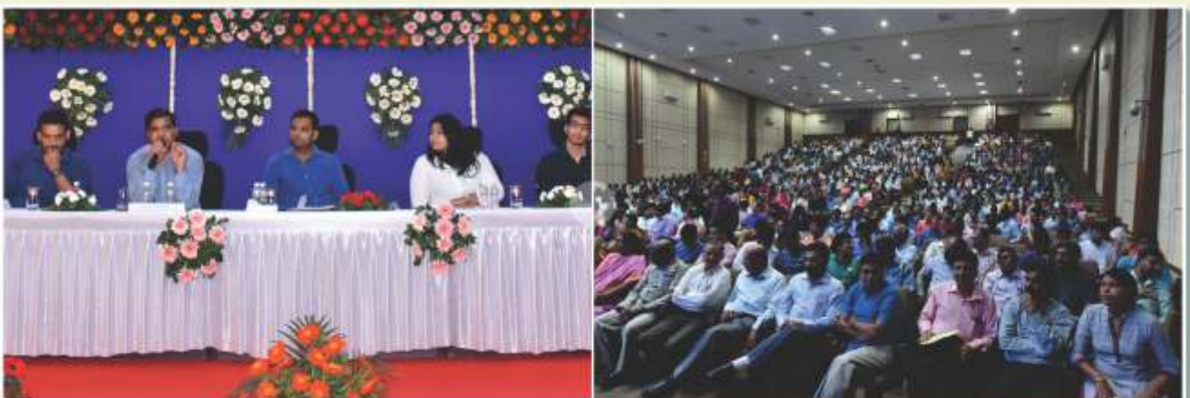
SSIP Awareness Program at Mahatma Mandir on 27 th March, 2017.