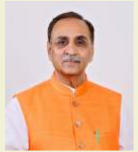
Shri Vijay Rupani Hon. Chief Minister, Gujarat.

“Gujarat is taking lead in the Hon. Prime Minister's initiative of Start-up India. One of the most important step is the launching of the Student Start-up & Innovation Policy(SSIP). I am glad that with this policy, Gujarat will be the first state in the nation to formulate and implement such a policy. My heartiest best wishes to the team of Education Department for this endeavour.”