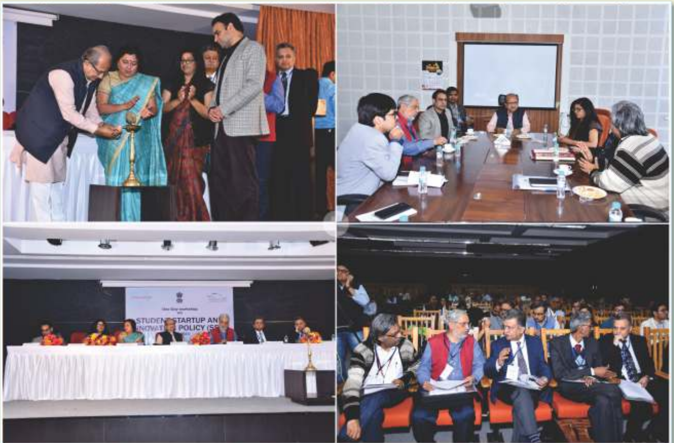
Developing Implementation Roadmap for Student Start-up and Innovation Policy (SSIP) 9 th February, 2017.